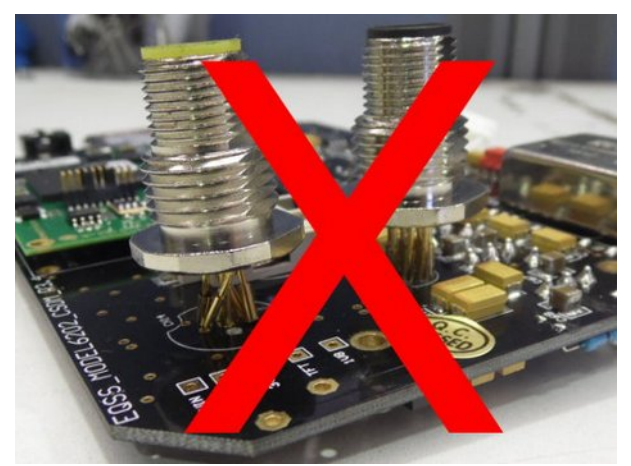
Illustration 2: Damaged Display Connector