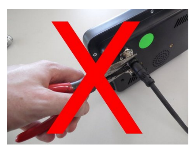
Illustration 3: Do Not Use Tools To Tighten Connector

Do not use any tools to tighten the connector.