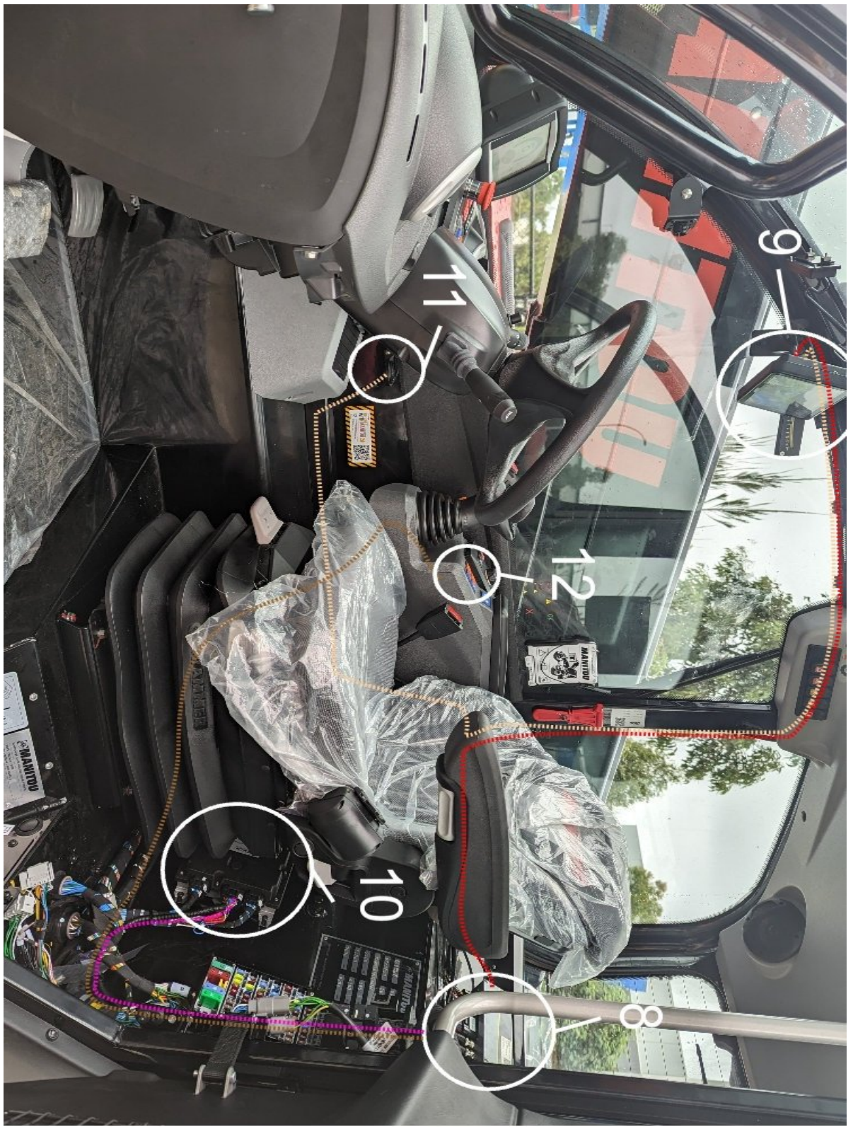
Illustration 3: Cabin