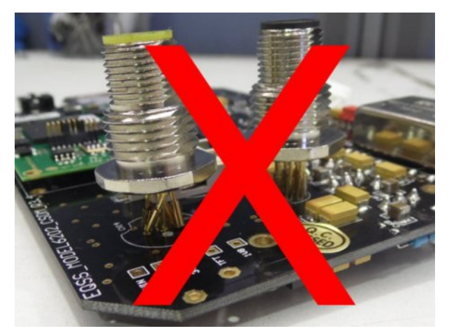
Illustration 5: Damaged Display Connector