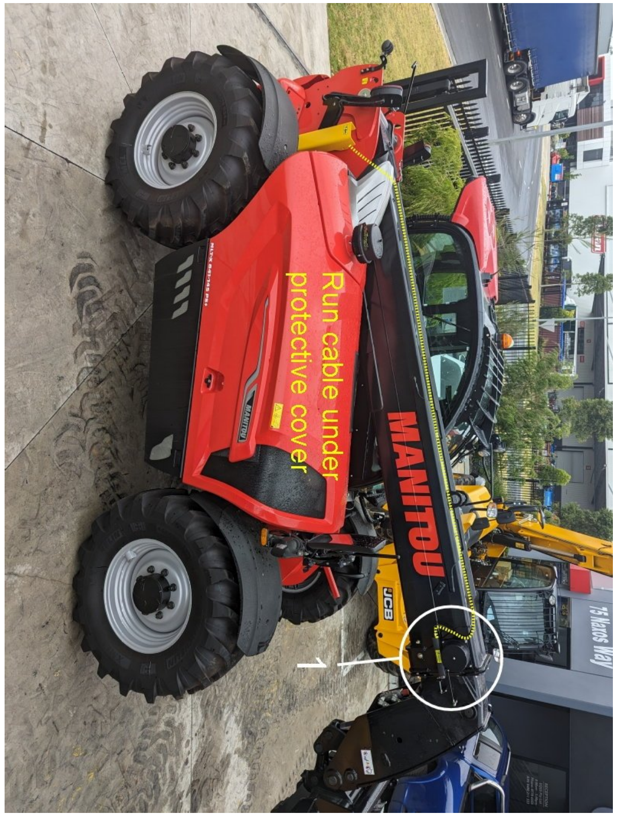
Illustration 1: Machine Boom