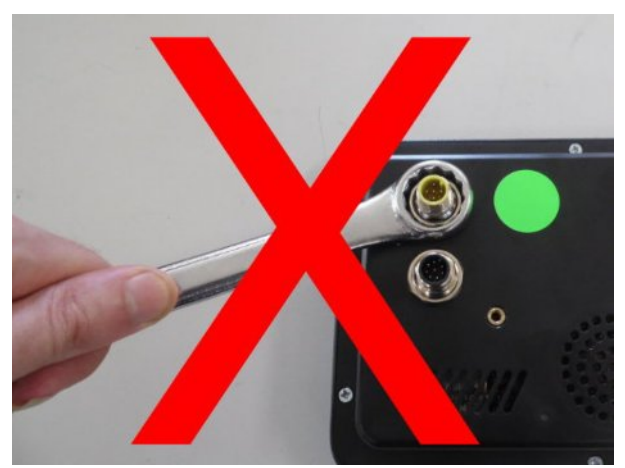
Illustration 7: Do Not Over Tighten Nuts

Do not over-tighten the nuts on the back of the display connectors. These nuts should only be hand tightened. If the nuts are overtightened it will damage the PCB inside the display.