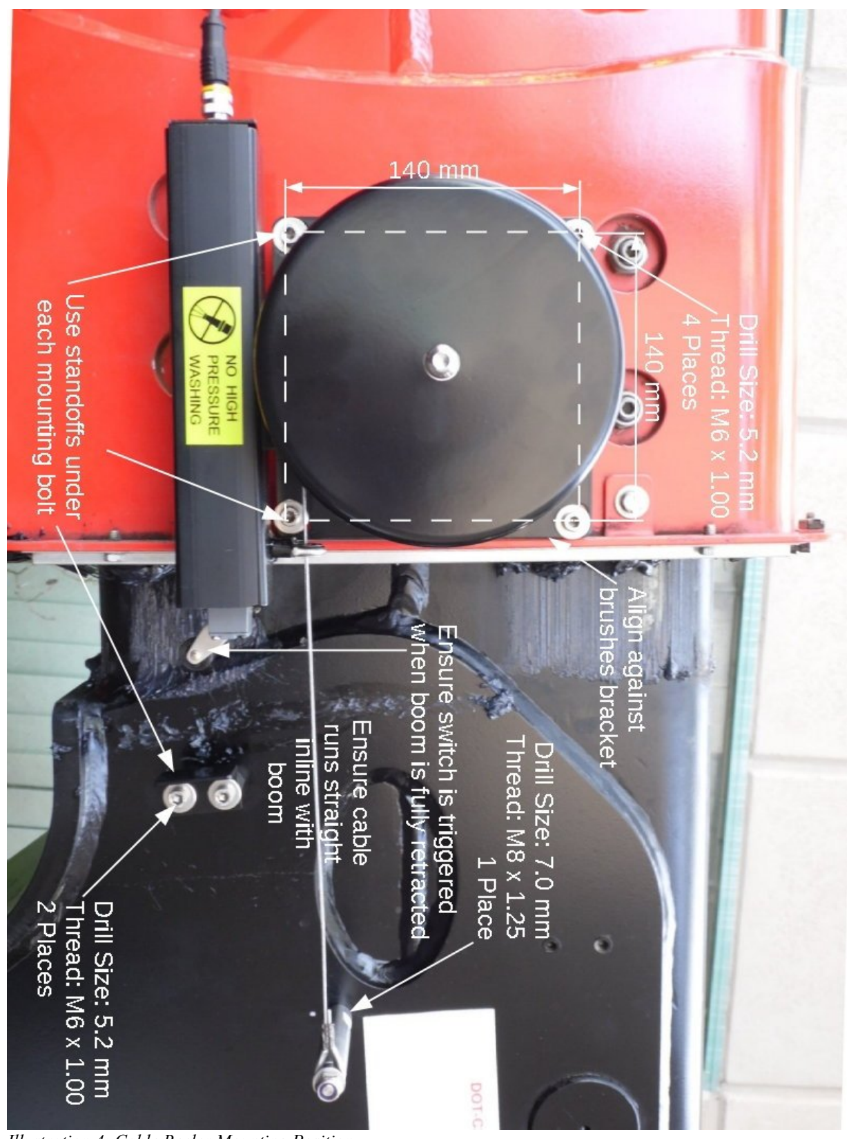
Illustration 4: Cable Reeler Mounting Position